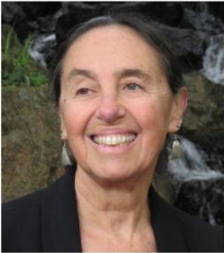
Linda Rudolph Center for Climate Change and Health